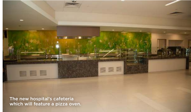
The new hospital's cafeteria which will feature a pizza oven.