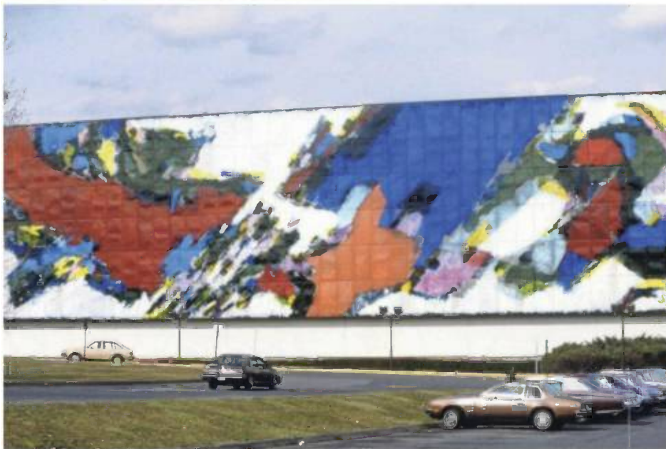
The colorful, 200-foot and locally iconic Stefan Knapp mural on the side of Alexander's department store in Paramus is seen on March 7, 1985, when it was about to celebrate the 23rd year (on March 19) of its completion.