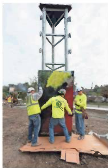
Carpenters for Edward Leske Company put up the panels of the mural in the courtyard of the new Valley Hospital in Paramus on Wednesday.