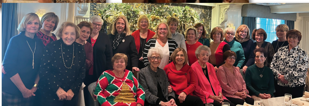
Mahwah Branch Holiday Lunch